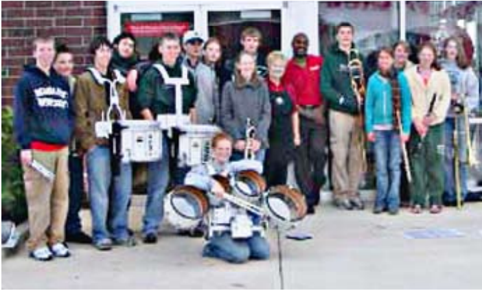
Volunteers from the ZCHS band provided pep band type music for the grand opening of the Cold Stone Creamery at 86th and Zionsville Road on October 28. The grateful store manager and an assistant are pictured in front of the store with the band.