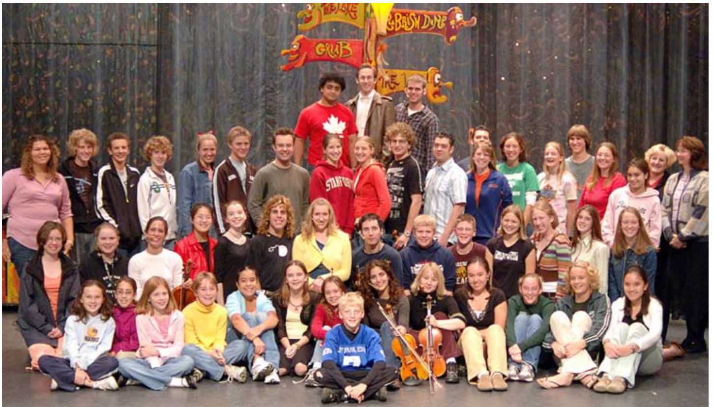
Member of Barrage gather on stage for a photograph with Zionsville Community School instrumental students during the afternoon sound check before the October 22 performance.