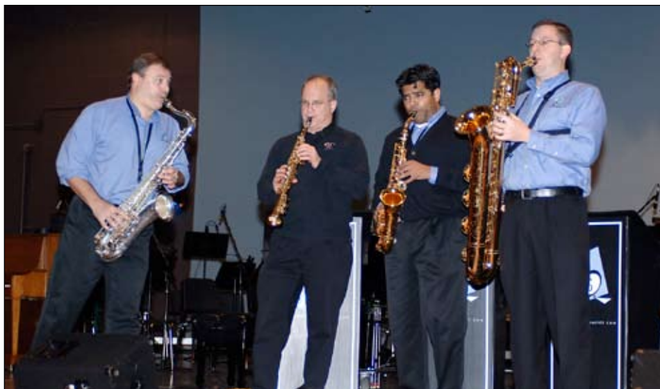
The Capitol Quartet, shown above during the clinic on Saturday morning, gave a dazzling performance at the Gala.

Whew! What an evening! And the best part is that ZBOP netted