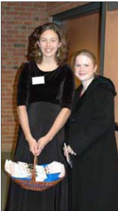
Student involvement was a key component of the Gala, and began in the morning with the clinic, above photo. It continued with students greeting, ushering and performing before the Gala, at intermission and at the Patron Party afterwards.