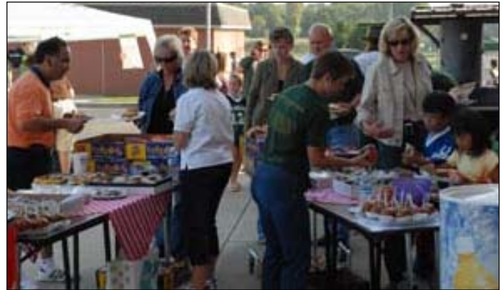
The awards ceremony at the Lawrence Central Competition on September 16 (above.) The Tailgate Party (above right) was a big success for ZBOP. Water beads on a metal fence at the Twin Lakes competition (right). The Color Guard's flags form a quilt of color during warm up (bottom right). The percussion and brass section bring up the line on the way to the warm up field at the Lafayette Jefferson competition on September 9 (below).