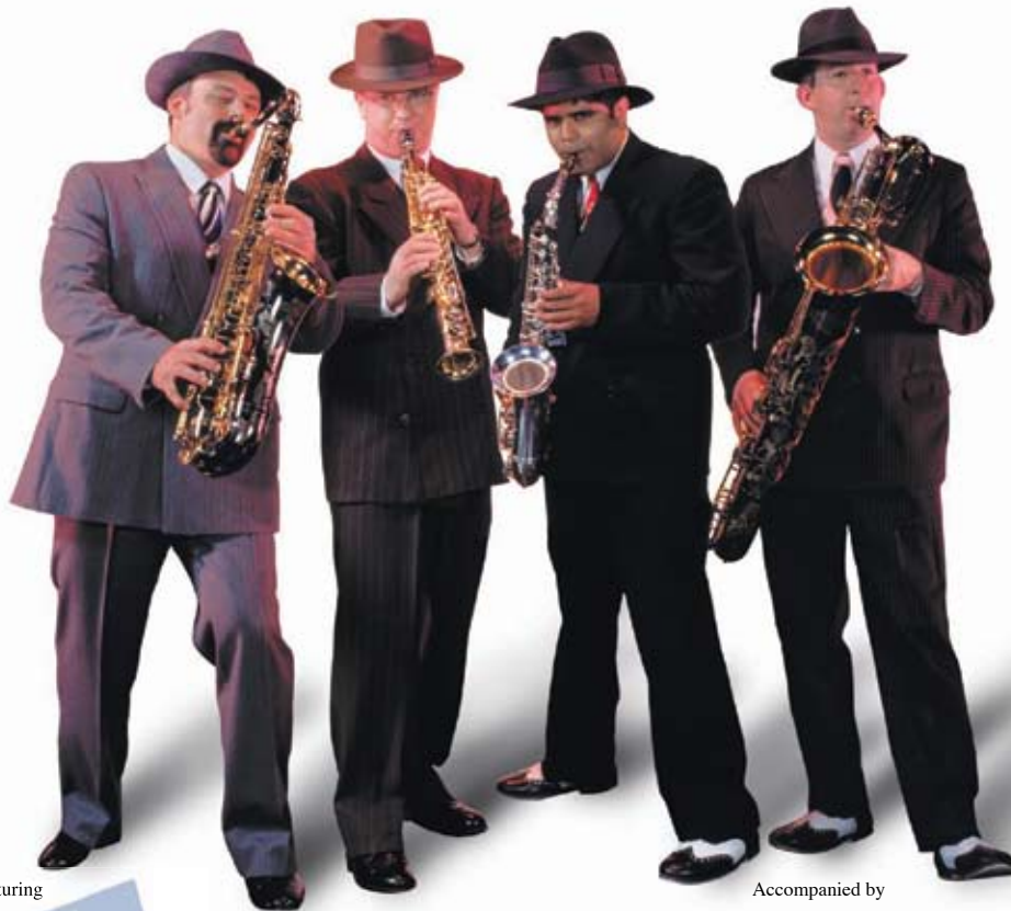
The Capitol Quartet proudly uses Yamaha Saxophones and Applied Microphone Technology (AMT) microphones.